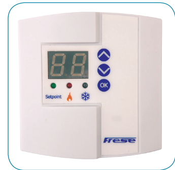
DELTA T control unit